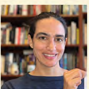
Dr. Sami Assaf

The greatest gift that you can give to mathematics is [...] your unique way of solving problems.