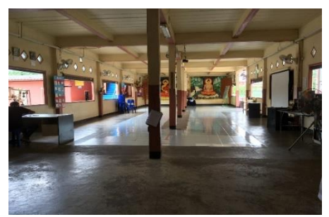
Figure 1: Addictions Center, Thailand 1

I recently had the privilege of participating in a counseling study abroad and presentation opportunity in Thailand. I am excited to share some of what I learned about international counseling and encourage you to consider it in your own future.