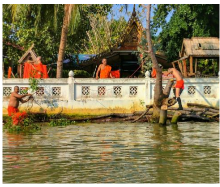
Figure 3: Monks along River, Thailand

If you are interested in both counseling and travel, it may interest you to know that in many countries, counseling is an emerging field with opportunities for service work to advance the profession. NBCC has an international division (http://www.nbccinternational.org) advancing counseling standards globally, and they often offer international trips such as an upcoming trip in March to participate in a Ugandan Mental Health Summit. American Counseling Association members may want to consider joining the International Interest Network in the ACA Communities forum. Study abroad or even internships combining counseling and overseas travel are available if you take time to search them out. Applying for a Fulbright scholarship might even make sense if you have hopes of doing paid research in another country (http://us.fulbrightonline.org/about/types-ofawards/study-research).